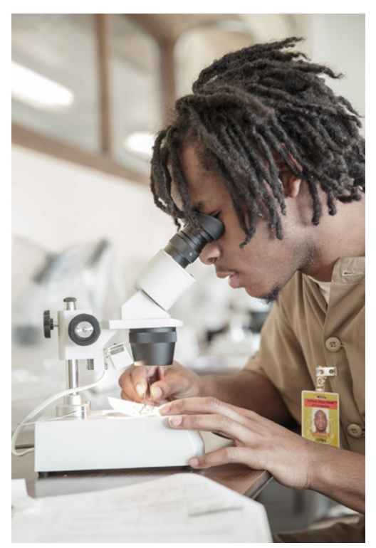
A student peers through a microscope in his Botany course at the Moreau College Initiative. Over 50 students have enrolled in this class since the Moreau College Initiative began to offer it in 2015.