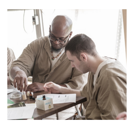
Students at the Moreau College Initiative conduct experiments in their Botany course.