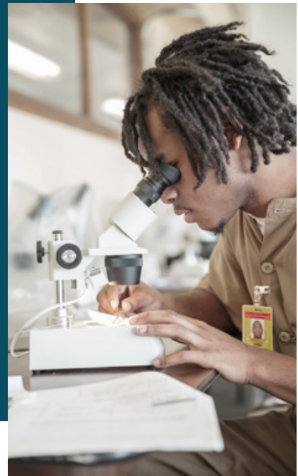
A student peers through a microscope in his Botany course at the Moreau College Initiative, which offers higher education to students while incarcerated.

However, research to date does not support this assumption. While further study is needed, research has not found a link between considering CJI in admissions decisions and rates of campus crime. 25 Furthermore, such conjecture discounts—and contradicts—the transformative nature of higher education most colleges and universities claim to provide. By collecting CJI and using it in admissions decisions, these institutions perpetuate the stigma and collateral consequences of past incarceration.