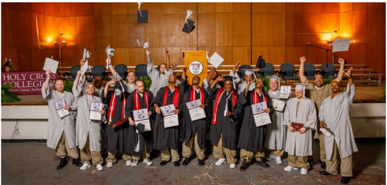
The graduating class of 2019 from the Moreau College Initiative in Westville, Indiana celebrates earning their degrees while at the Westville Correctional Facility.

It is clear that criminal screening of college applicants is common, and yet research has not found evidence that CJI admissions policies have served their intended purpose: making campuses safer.