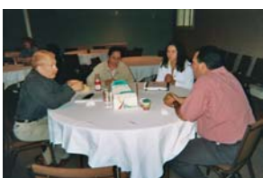
Members of the Active and Collaborative Learning Benchmark Group