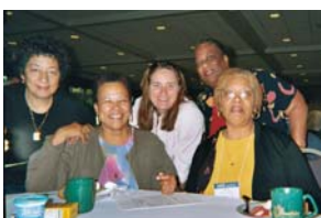
Medgar Evers and University of the Virgin Islands team members