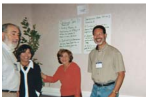
BEAMS participants during campus sharing time

Information about the 2005 Academy, which will be in Snowbird, Utah, July 13-17, will soon be out for 2004 cohort campuses. Watch the WebCenter for details.